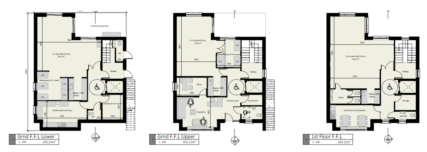
Figure 4 Proposed Floor Plan of the Creche Facility to be provided as part of this SHD Application