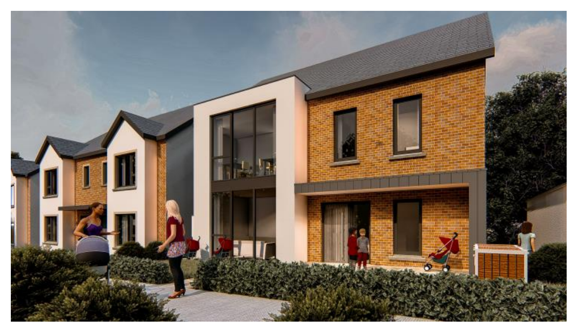
Figure 1 3D image of proposed Creche