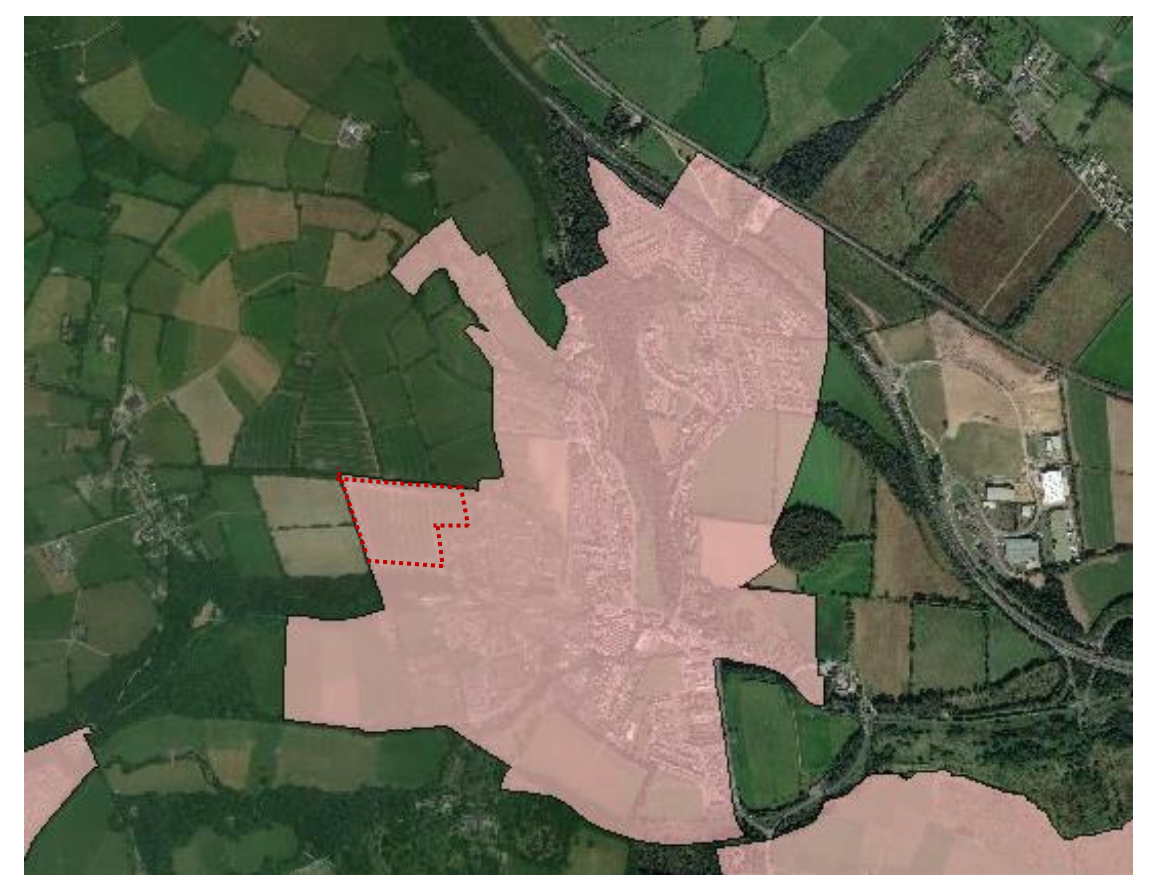
Figure 2 Extract from SapMap showing Blarney, with the proposed development site identified by dashed red line